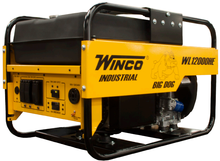
NEMA 5-20R 20A